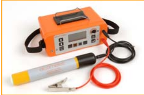
Elcometer 3312 with Half-Cell & memory

Elcometer 3312 Covermeters with Half-Cell allow users to not only identify the location, orientation, depth and diameter of stainless steel rebar, but also the potential for corrosion all in one easy-to-use gauge.