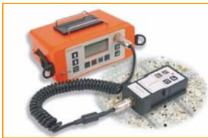
Elcometer 3312 B Covermeter

The gauges store up to 240,000 cover and Half-Cell readings side by side in their extensive memories. Available in models SH and TH, the Elcometer 3312 Covermeter with Half-Cell is perhaps the most versatile and cost effective Covermeter on the market today.